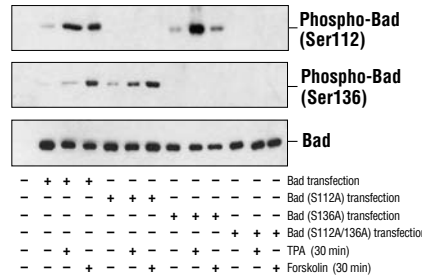
Western blot analysis of extracts from 293 cells transfected with Wild-type Bad, Bad (S112A), Bad (S136A) or Bad (S112A/S136A), untreated, TPA-treated or forskolin-treated, using Phospho-Bad (Ser112) Antibody #9291 (top), Phospho-Bad (Ser136) Antibody (middle) or Bad Antibody #9292 (bottom).

Entrez-Gene ID #572 Swiss-Prot Acc. #Q92934